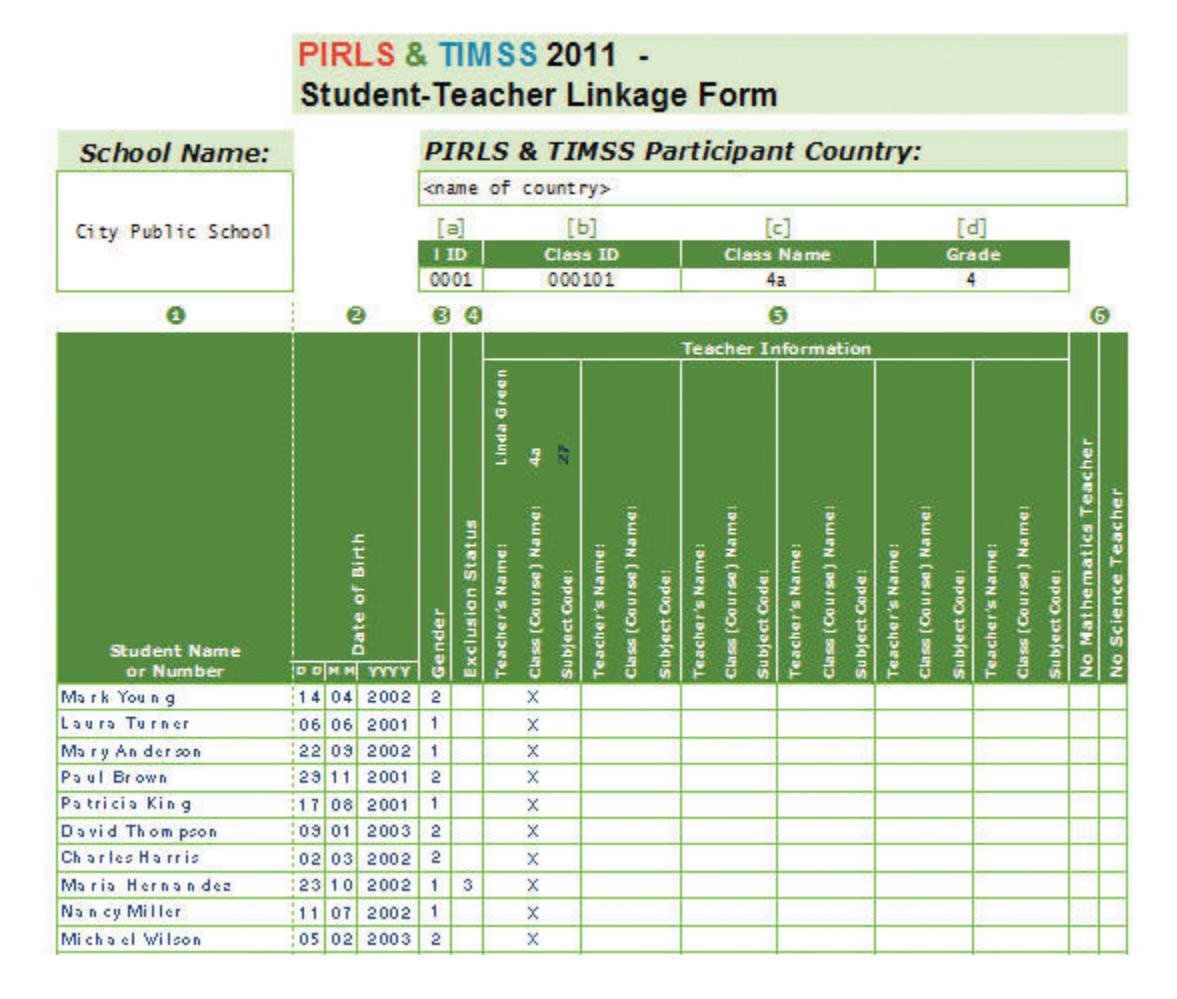
Example 3: Completed Student Listing Form for PIRLS 2011